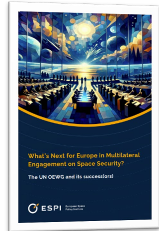
Multilateral engagement on Space Security