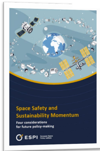
Space Safety and Sustainability