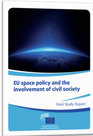
EU Space Policy and the Involvement of Civil Society