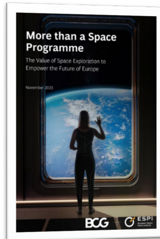
More than a Space Programme