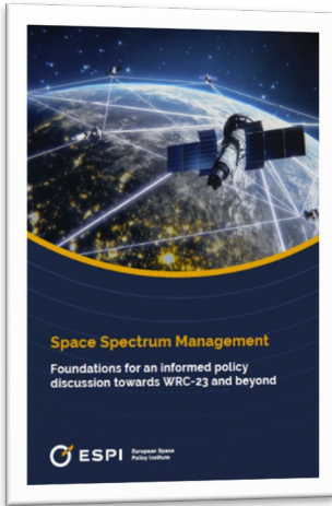
Space Spectrum Management.