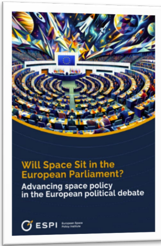
European Parliament Elections