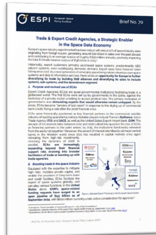
Trade & Export Credit Agencies, a Strategic Enabler in the Space Data Economy