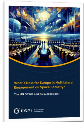
Multilateral engagement on Space Security